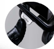
includes central brake